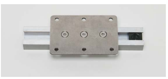
Mounting plate is available. Refer to GS-LGB30-P65-100 for details.