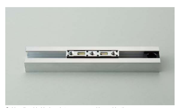
Guide rail, guide block and stopper are used in combination. For combination drawings, refer to GS-LGB30-400